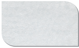
Galvalume Plus ‡